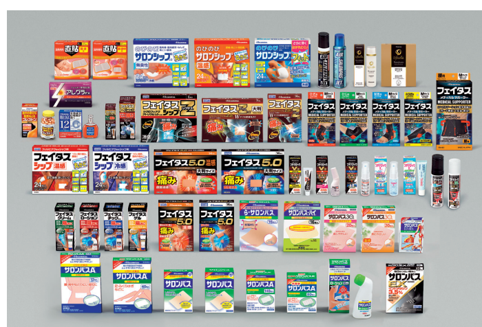
Over the Counter Products